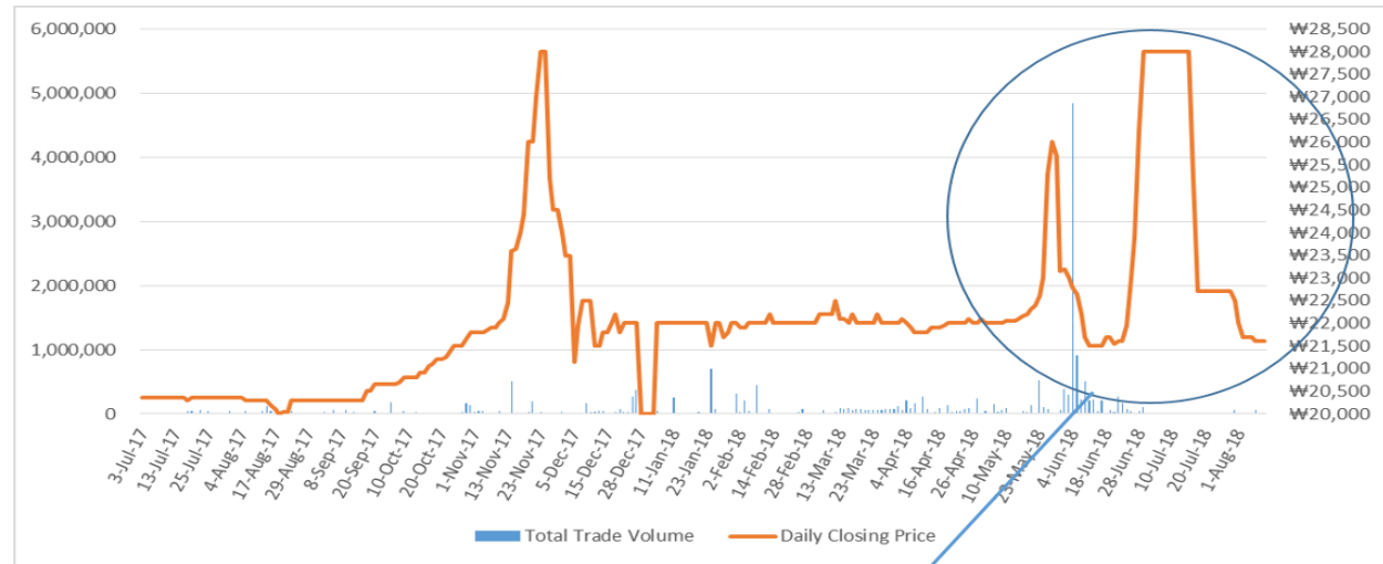
Figure 2. KAU17 Trading Performance (June 2017 – August 2018)